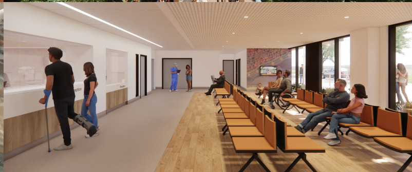
Images are for artistic representation only and are subject to change.