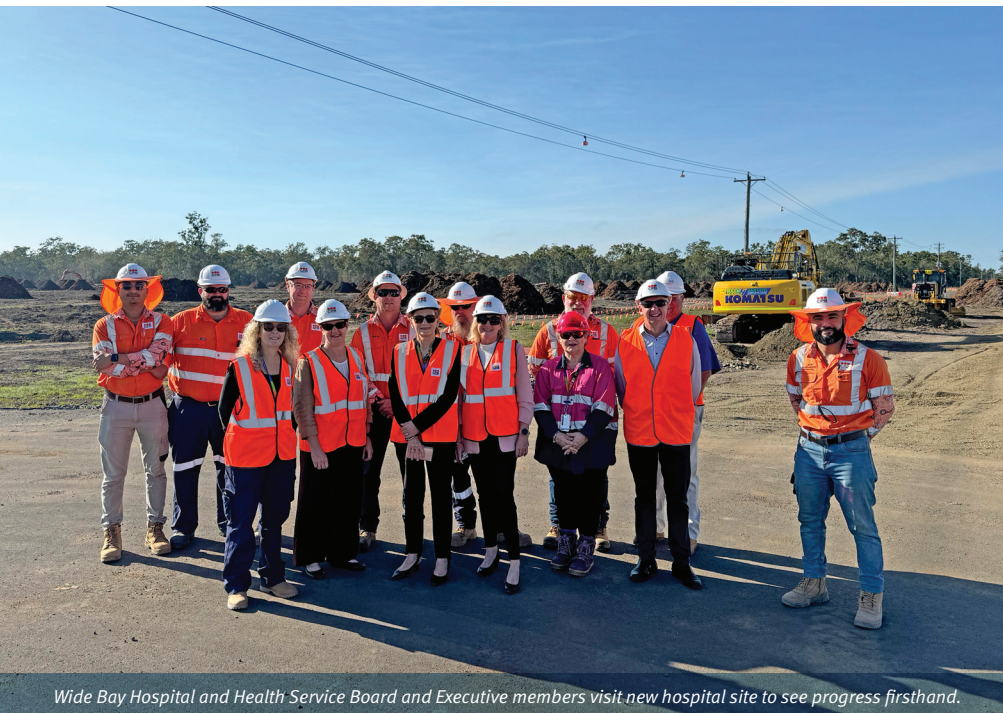
Wide Bay Hospital and Health Service Board and Executive members visit new hospital site to see progress firsthand.

With the new hospital site being about 600 metres from the closest public road, Eggmolesse Street, we'll be sure to keep sharing updates via newsletters and social media so you can see how your new hospital is taking shape.